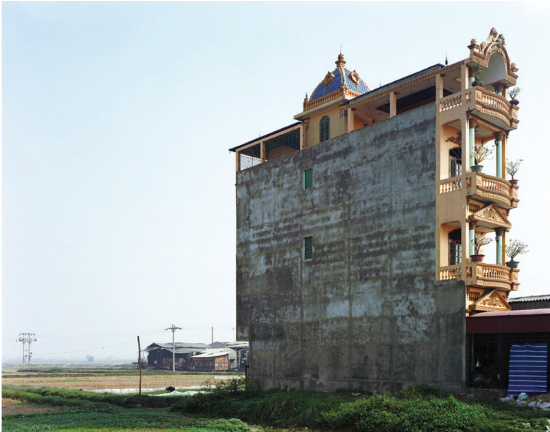
North Hanoi, 2003