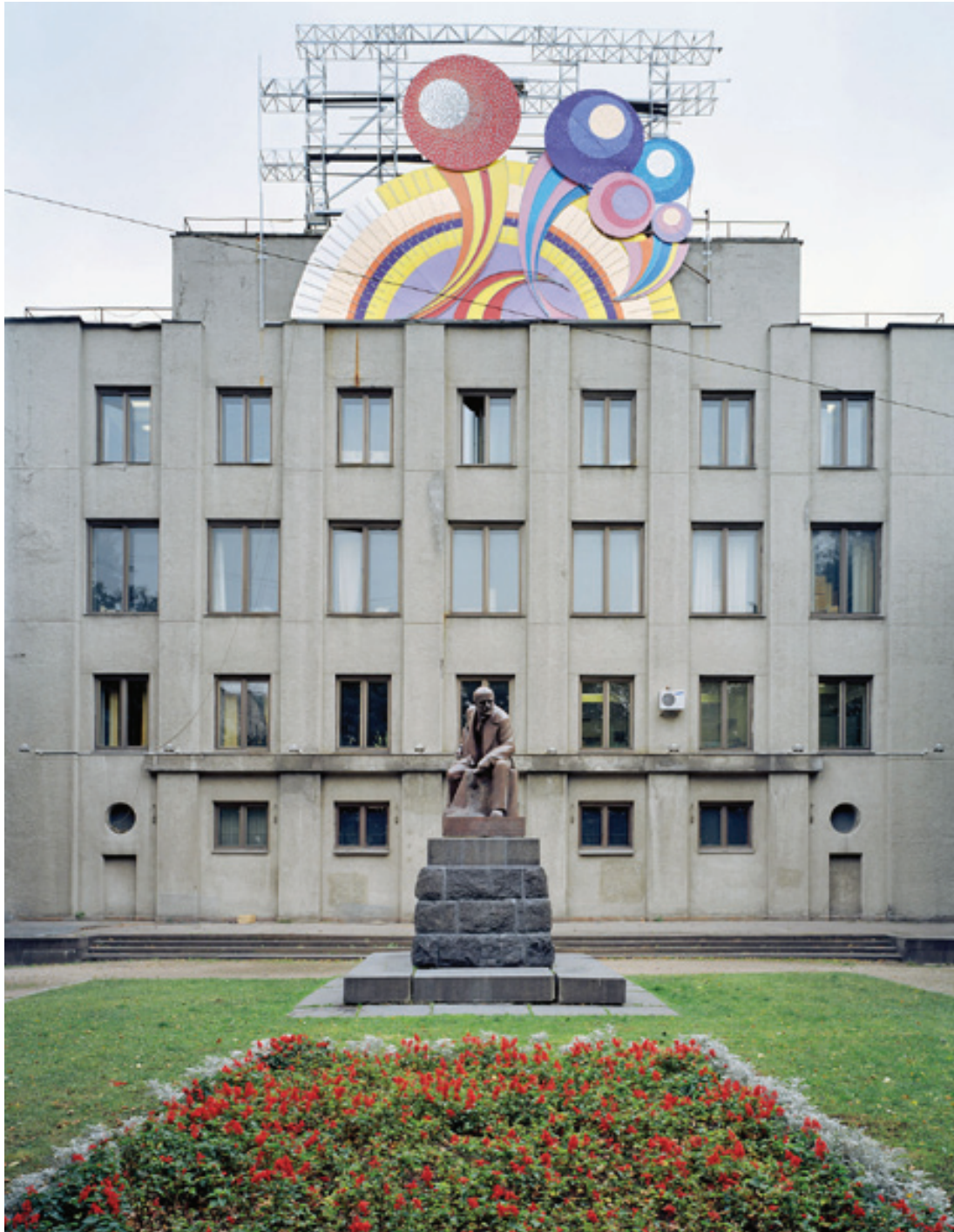
Happy Lenin Moscow, 2008