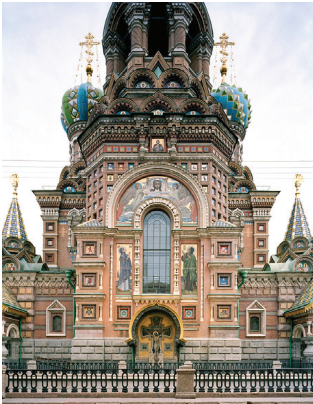
Saviour of Spilled Blood, 2008