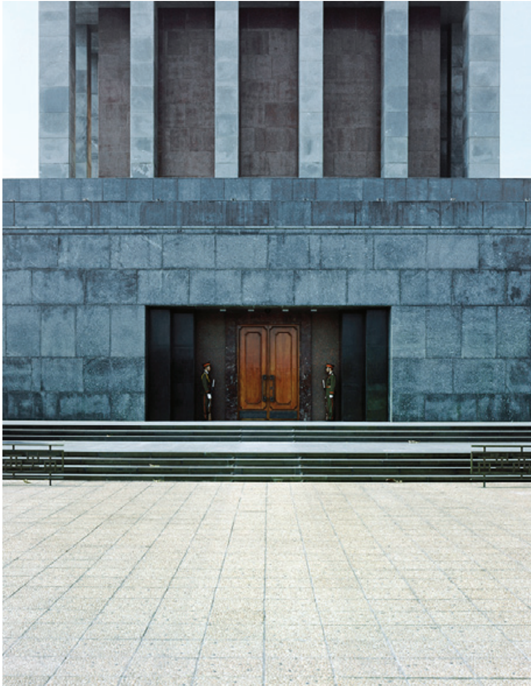
Hanoi Mausoleum, 2003