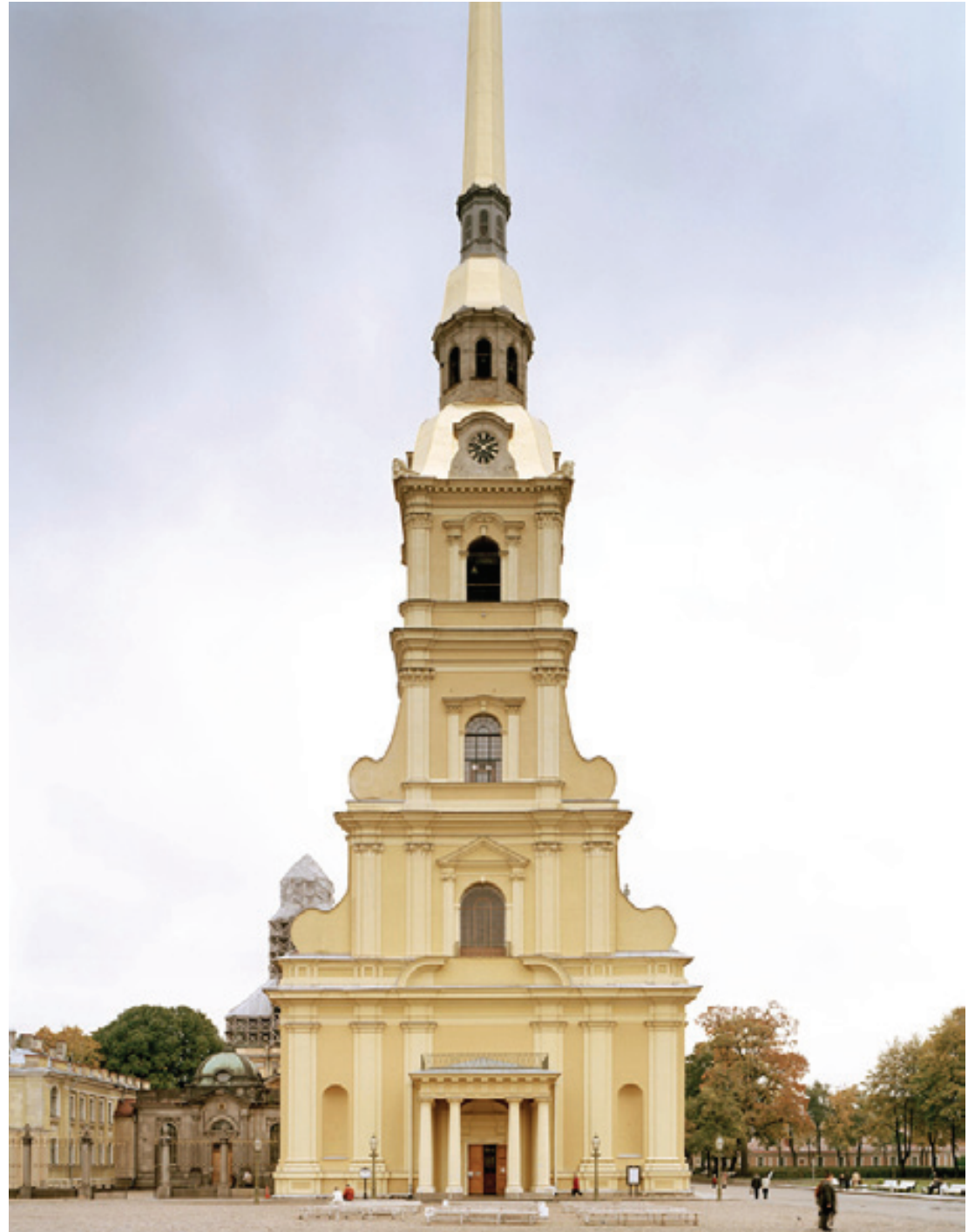
Peter and Paul Cathedral, 2008